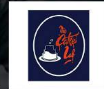
THE CAKE LAB