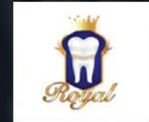
ROYAL DENTAL CENTER